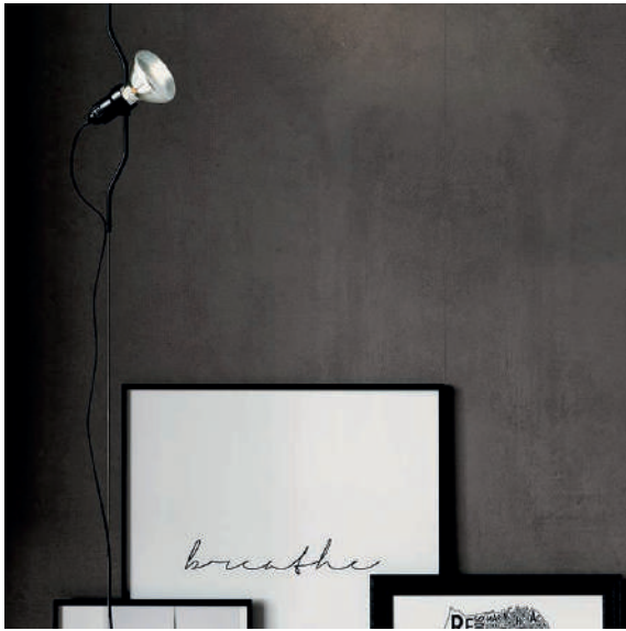
MOBILE SAMPLE LIBRARY REFERENCE Concrete Look High Slip Semi-Polished EPD Group 1 - Garda Range