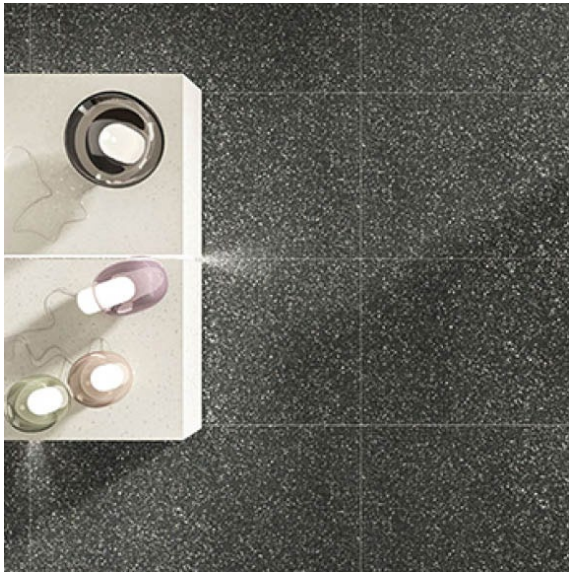
MOBILE SAMPLE LIBRARY REFERENCE Porcelain Terrazzo Look