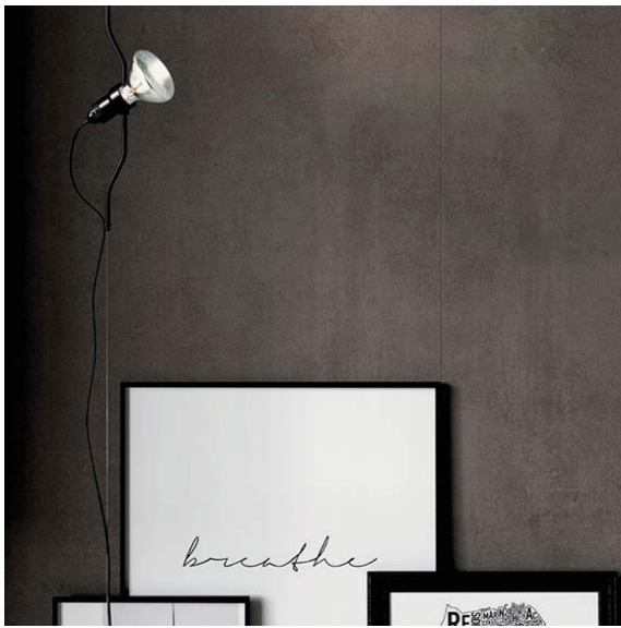
MOBILE SAMPLE LIBRARY REFERENCE Porcelain Concrete Look