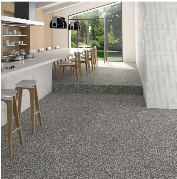
MOBILE SAMPLE LIBRARY REFERENCE Porcelain Terrazzo Look